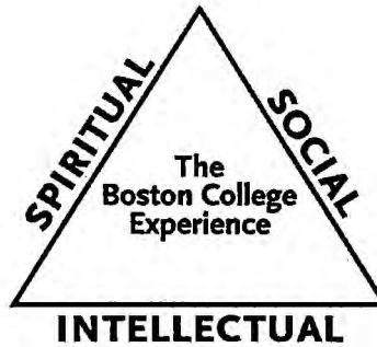
Figure 1: Three Dimensions of Formation

be apparent, but students of any religious tradition or none ought to be able to find at BC a supportive environment for deepening their own faith lives or, in less explicitly religious language, discovering how to live authentically within a horizon of ultimate meaning.